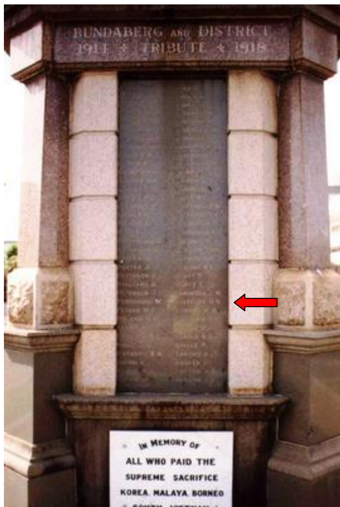
Bundaberg War Memorial